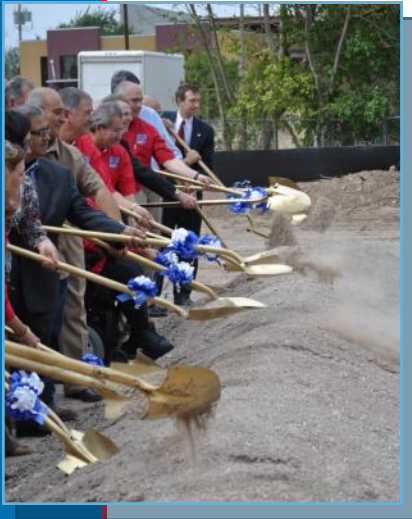
The ceremonial ground breaking of the new AHSTI HomeOwnership Center.